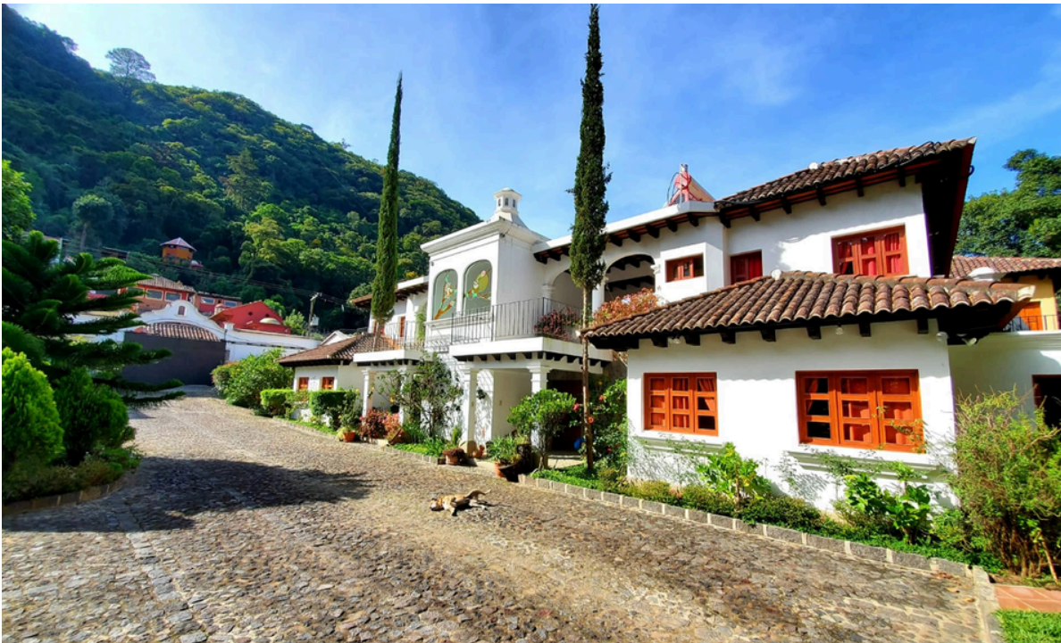
HOTEL – CASA BUHO