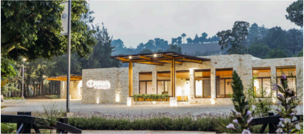
NASIR HOSPITAL – GIFT OF SIGHT